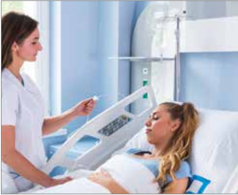
Sockets for mounting the IV poles in four corners of the bed (two sockets for a hand grip are also available in addition to those 4 sockets).