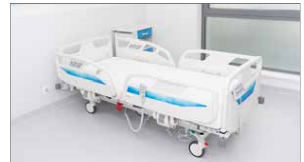
Low position. It allows for safe sleep and comfortable sitting on the bed and getting up. It also allows for easy transfer to a wheelchair.