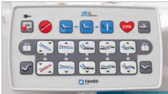
Preprogrammed positions. You can easily set useful and frequently used bed positions with a single button and save time.