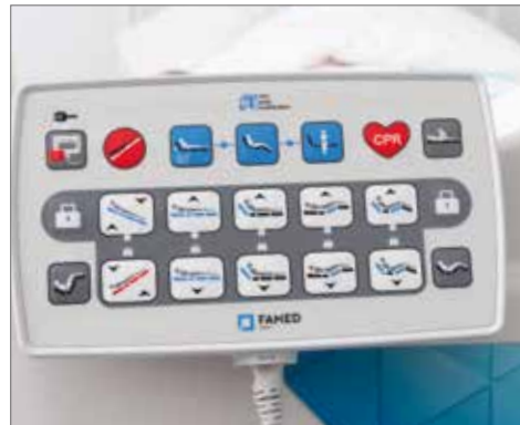
Central panel (supervisor) with VEM functions, one-button positions and electric CPR.