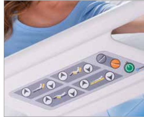
A panel for personnel with quick access to the Trendelenburg tilt.*