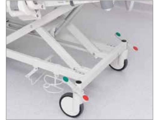
Unlocked wheel alert and low battery warning