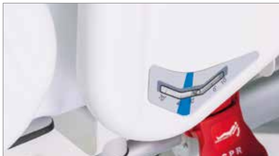
Optimal angle indicator. Indicators help to position the patient in the prevention of ventilator pneumonia (VAP).