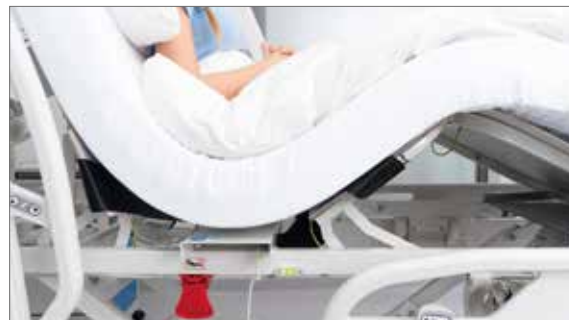
Double autoregression. Reduction of excessive pressure in a sitting position in the area of the lumbar spine and shin.