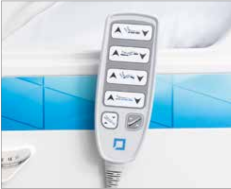
10-button wired remote control. Controls can be locked from the remote itself - by pressing a button combination. Quick-disconnect functionality for the remote control available in the Fortis version.