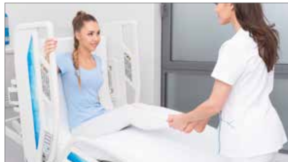
As many as 9 grip points in the side rails, it allows you to conveniently and safely change positions and get out of bed.