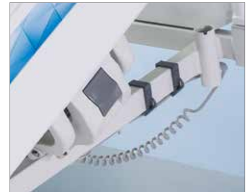
Plastic hooks that can be removed and moved.