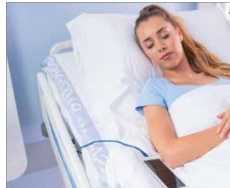
USB socket for charging mobile devices.