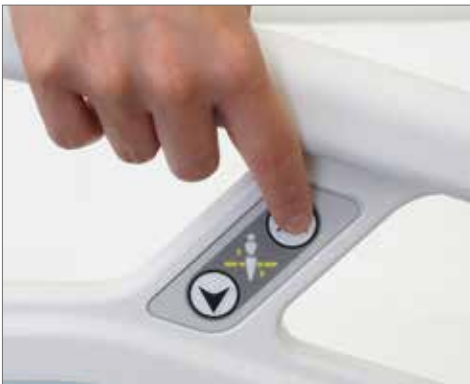
VEM mobilization buttons for the patient (up and down movement available when holding the side rail and standing up).*