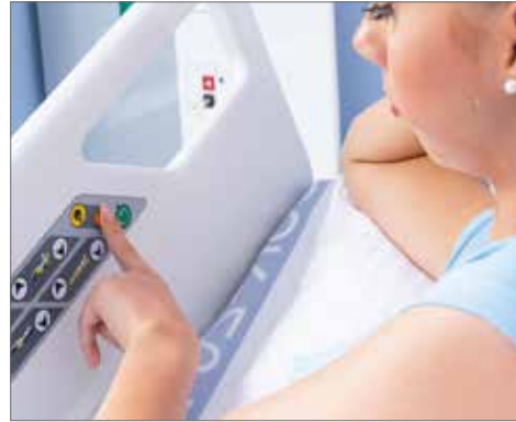
A panel for the blind and partially sighted (3D-profiled, contrasting markings).*