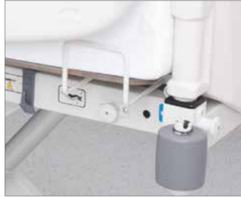
Bed length extension with lock (not available in the Light and Fortis version) allows for a comfortable stay also for taller patients.