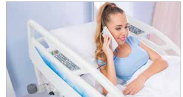
USB socket. Possibility to charge personal devices. Equipped with a sealed cap.