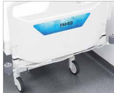
Integrated storage space for the power cord, e.g. when transporting the bed.