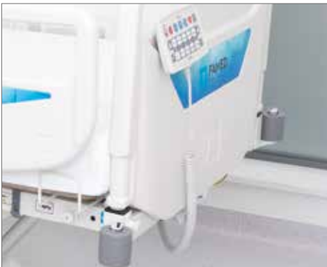
Foot boards with lock. In the Fortis version, the boards are permanently fixed to the bed frame.