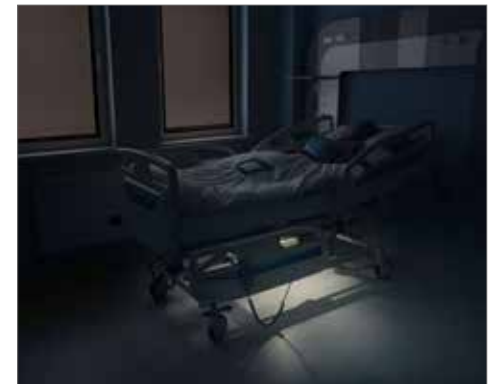
Ambient LED light under the bed.