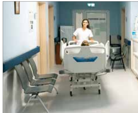
Fifth wheel makes it easier to guide the bed in narrow places.