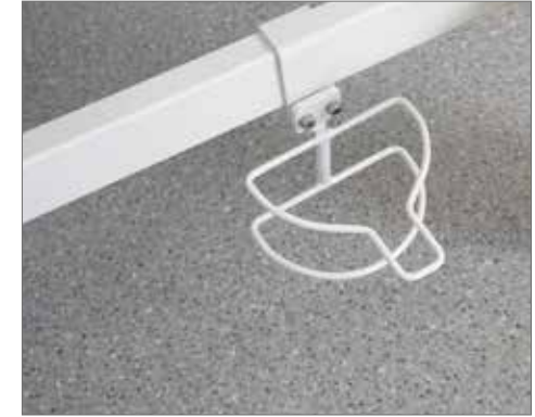
Urine bottle holder