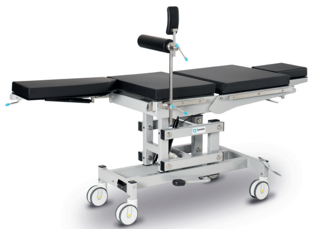
Famed AS-88 knee arthroscopy attachment

Edition 282/2024/03/3 Famed Żywiec reserves the right to modify the product and specification as part of technical progress. All illustrations and photos used in this material are for illustrative purposes only and may not reflect the finished product. The people shown in the photos are not medical professionals. They are models. The device presented in the catalog is intended for use in health care facilities by authorized persons after having read the manual (IFU).