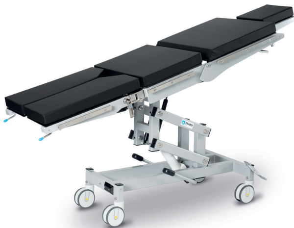
Anty-Trendelenburg position 15°