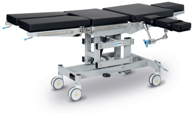
Arm support Famed FlexArm™ AS-70.3