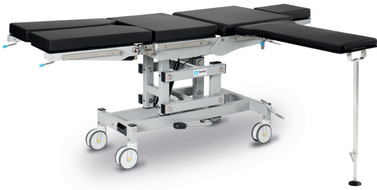
Famed AS-69 hand surgery tabletop