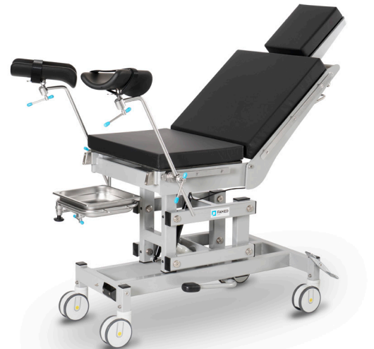
Knee support Famed WS-05.5